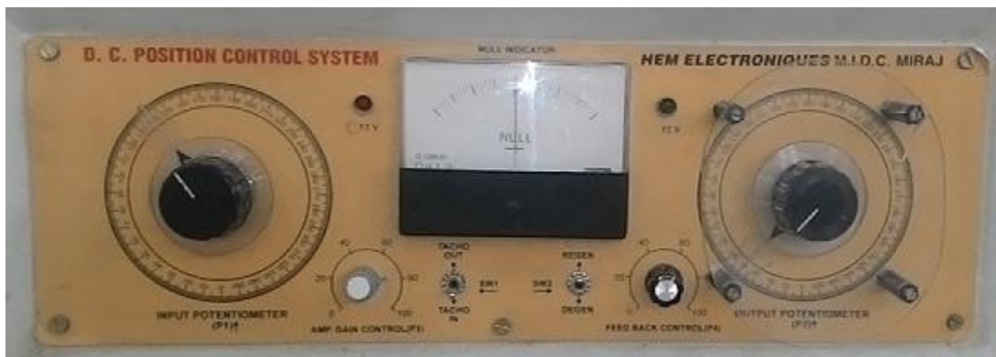
Fig 3. DC Position Control System